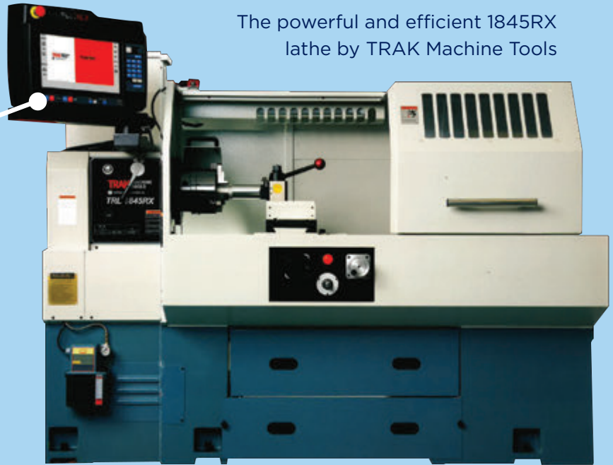
The powerful and efficient 1845RX lathe by TRAK Machine Tools

Our new high tech CNC lathe is specifically designed for smaller batch runs and custom one-offs